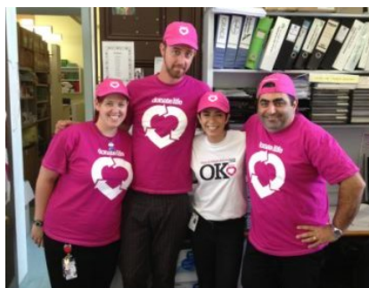
Coordination Team geared up and ready to 'promote'!