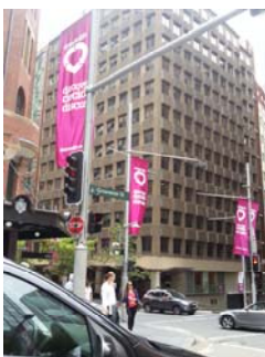
Street Banners in Sydney CBD