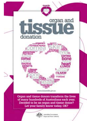
One of the promotional posters used for Donate Life Week

With the theme of 'Make your wish count — discover, decide, discuss organ and tissue donation' the annual National DonateLife week of promotion was held this year from February 24th to the 1st March. Staff embraced their inner 'magenta' and participated in a number of activities including: the NSW launch held with the North Bondi Nippers and the NSW Minister for Health at Bondi Beach, prepared an article for a local Arabic newspaper and assisted with information displays and stalls held at many hospitals including Sydney/Sydney Eye Hospital and Sydney University Orientation Week.