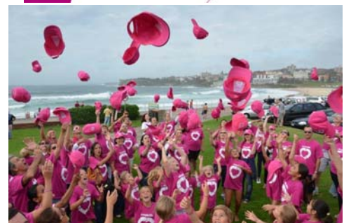
2013 Donate Life Week NSW launch, Bondi Beach