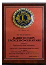
SAMPLE AWARD PLAQUES