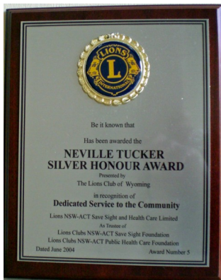
SAMPLE AWARD PLAQUE