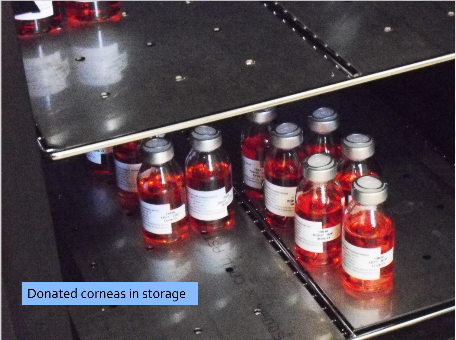
Donated corneas in storage