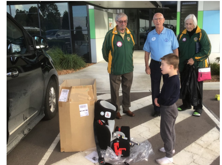
Lions Club of Wyong Inc (N3) Provision of a Carrot 3000 L/L Car seat Restraint System (Above)

There are many ways to support the ongoing work of the Foundations;