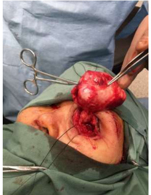
A REMARKABLE OPERATION FUNDED BY OUR SAVE SIGHT FOUNDATION